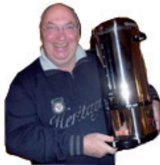
iPAC Founder (with Percolator)